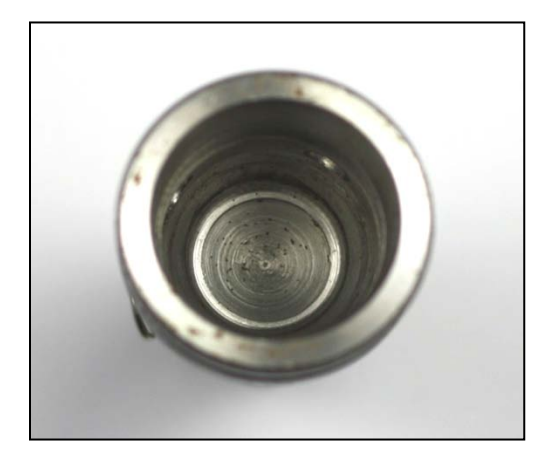
Figure 6a - Internal View of Figure 6