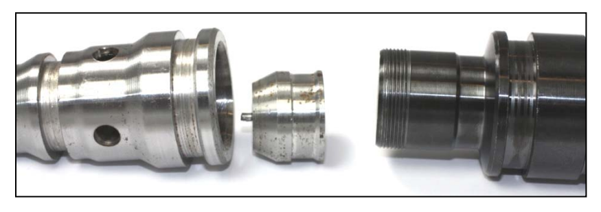
Figures 5, 6 , and 7 depict a disassembled counterfeit injector. From these images it is easy to see that there are no functional internal components.