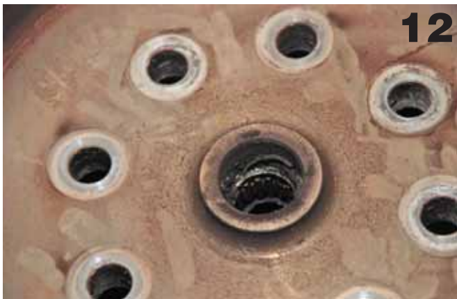
12 One key to how well a new clutch will work is determining what was wrong with the old one. Note that the pilot bearing has been pressed too far into the flywheel. The bearing should be flush. This is why just the end of the transmission input shaft was contacting the pilot bearing. Along with the missing dowel pin, this easily could have led to a misaligned clutch disc and possible engagement slippage or other problems.