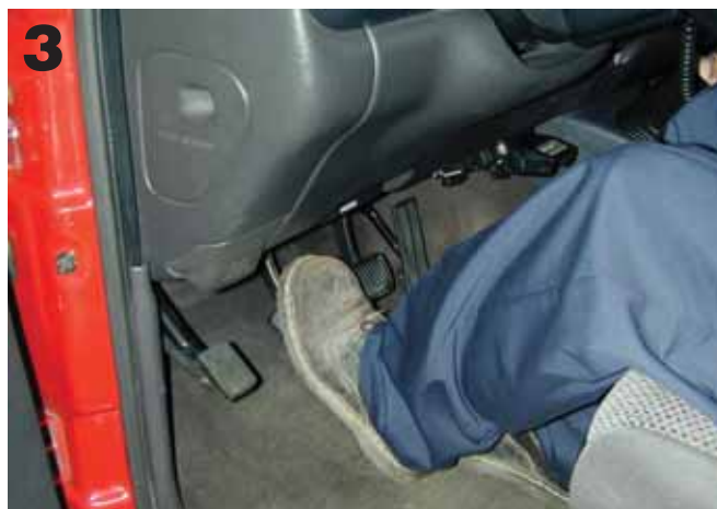
Clutch problems include slippage, insufficient free play and engagement difficulty. One of the primary checks of a clutch is for initial free play. If you don't know what is normal, however, you won't know what is abnormal.