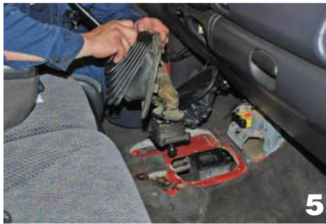
The first step in replacing a clutch on most diesel pickups is to remove the shift linkage from the transmission. This is easily done through the passenger compartment. Of course, you need to be careful to keep the vehicle's interior clean and keep track of all the bolts, clips, trim pieces etc.