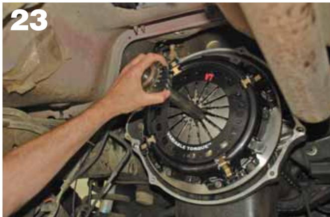
An input shaft is being used to position the clutch disc properly while the pressure plate is bolted into position. Many technicians believe that a metal input shaft is a better alignment tool than the molded plastic ones included in clutch kits.