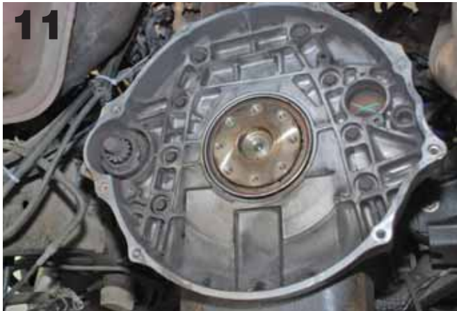
11 With the clutch assembly and flywheel removed, a quick visual inspection shows everything to be in good order except for the missing dowel pin. There are no cracks, nicks, breaks, pry marks, areas of contact with rotating components etc., so at this time the clutch reinstallation can begin.