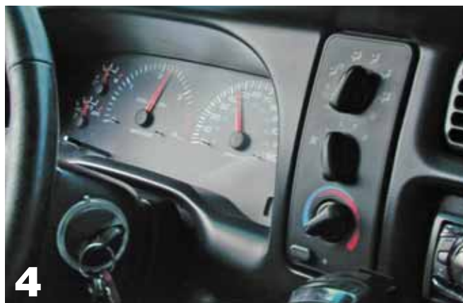
Another clutch check on a performance diesel vehicle involves driving at highway speeds and accelerating, or downshifting and accelerating. Watch the tachometer on the dash. Often, initial slippage of the clutch will show up as an engine-speed spike. You should always perform this check before doing any clutch work on a performance diesel.