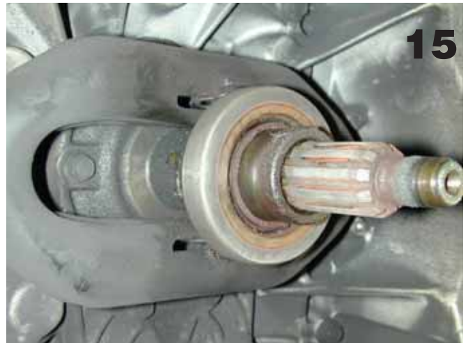
15 The release bearing slides on the transmission input shaft. Note the small metal shavings and particles on the part of the input shaft that contacted the pilot bearing.