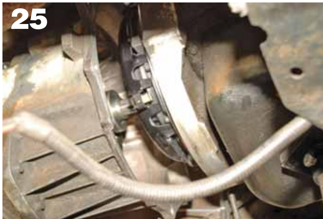
With the unit properly supported on a transmission jack, the input shaft of the transmission is being inserted through the pressure plate and into the clutch disc. The shaft should slide through the clutch and into the pilot bearing easily if you have the components aligned properly.