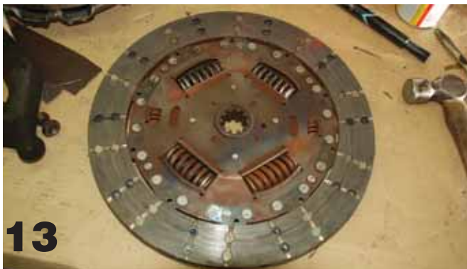
13 Note the rust or red dust around the damping springs on the clutch disc that was removed. There are no cracks in the disc, but the damping spring openings at the 11 and 1 o'clock positions appear larger and the springs are not being properly retained. This is one sign of a clutch that is starting to fail. On a performance clutch that is engineered to handle the torque, this will not be an issue.