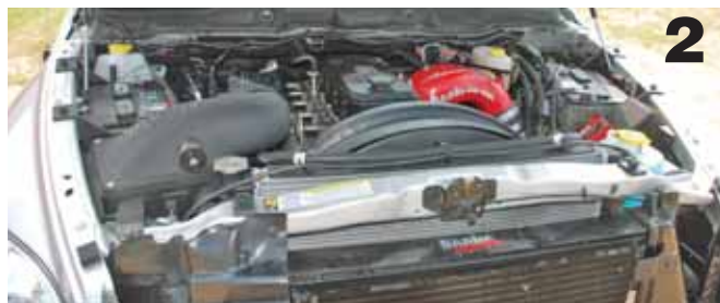
This late-model Dodge truck has a few bolt-on performance upgrades. Horsepower on these trucks can easily exceed two or three times that of the average gasoline-powered truck. The driveline – particularly the No. 1 coupling component, the clutch – is critical.