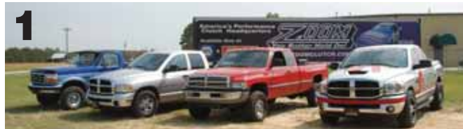
Performance diesels are commonplace today. These trucks are just an example of the variety and types of vehicles using diesel power that require a heavy-duty clutch.

A few weeks later this truck was drag-raced in four-wheel-drive mode. It was started in third gear with the tach fully red-lined to spool up to turbo and then accelerated down the drag strip. The clutch was up to the challenge, and after the race the truck was driven back home, maintaining velvet-smooth shifting.