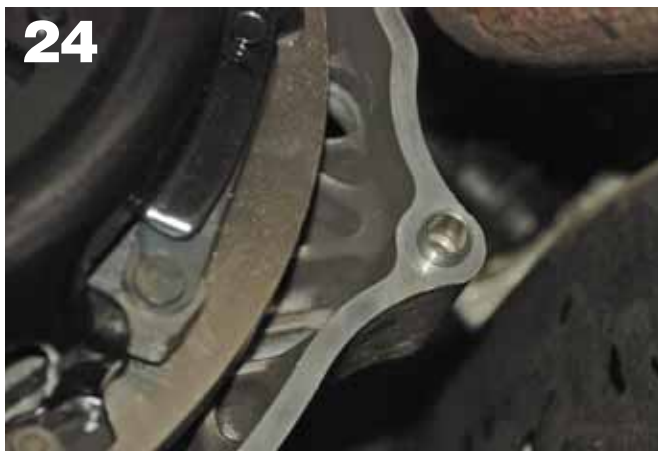
One of the new dowel pins has been installed in the bellhousing. Installing new dowel pins in previously cleaned holes ensures correct alignment of the transmission with the engine.